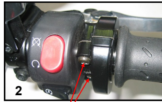
2 Throttle Assembly Clamp Screws