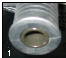
1 Spyder End Cap Removed

USA Patents "U.S. Pat. No. US D593,462 S" "U.S. Pat. No. US D593,463 S" "U.S. Pat. No. US D593,464 S"