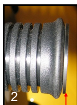
2 Plastic Thrust Washer Fitted